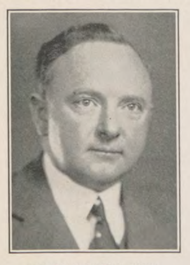
SENATOR HARRY F. BYRD Commencement Speaker

A METHODIST clergyman interned in Germany for the duration of the war, a United States Senator, and a medical missionary to China are among the nine persons on whom the College will confer honorary degrees at the annual Commencement exercises on June 1.