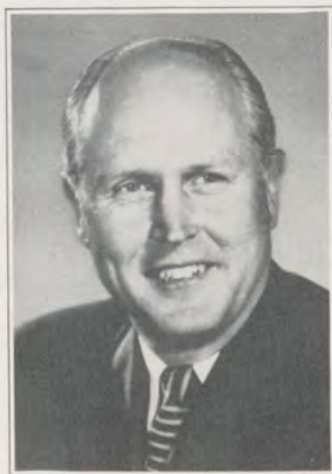
Arthur B. Langlie

The Honorable Arthur B. Langlie was Governor of Washington from 1941 to 1957, when he became President of the McCall Corporation. A lawyer by profession, he has had a distinguished career as a public servant from his earliest days as a City Councilman, and then Mayor of Seattle, Wash., before his election in 1940 as Governor. He was United States Delegate to the ILO Conference in Geneva, Switzerland, in 1954, and was a member of the President's Committee on Traffic Safety in 1955, and is a member of the National Civil Defense Advisory Council. He was also a member of the executive committee of the Attorney General's Conference on Court Congestion and Delay