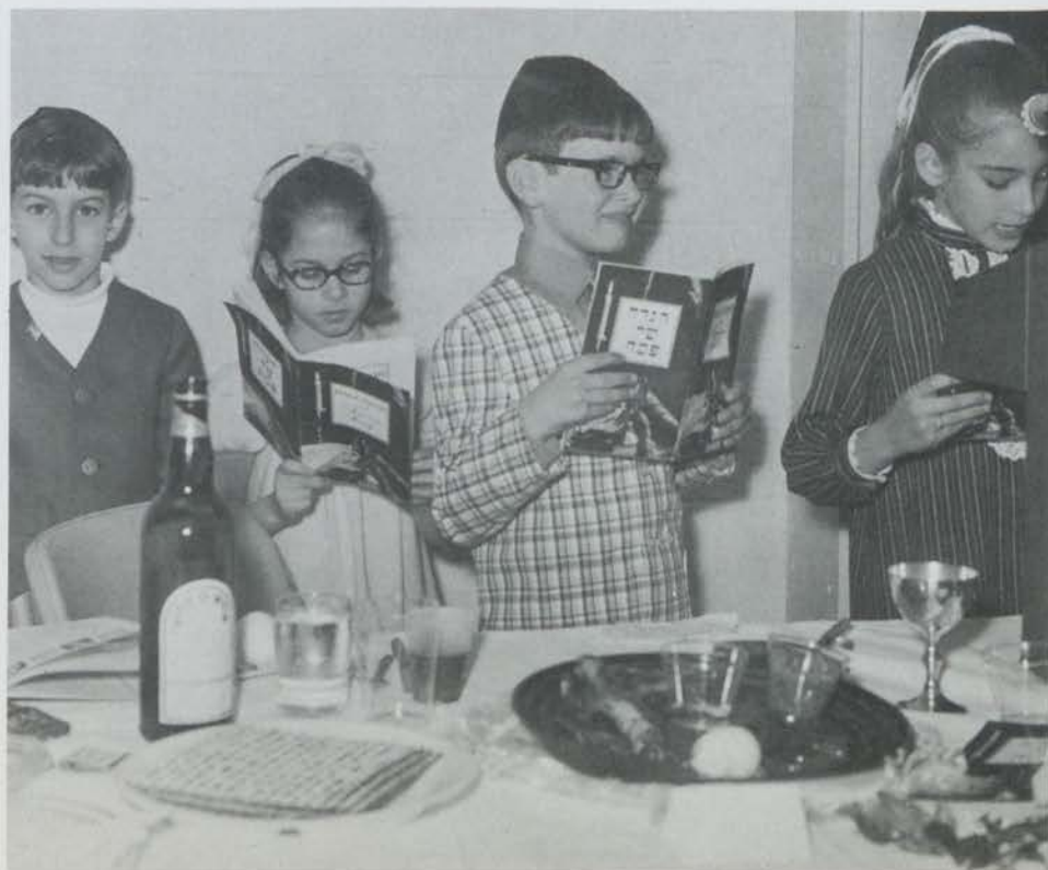
A few of the younger guests at the Seder ask the traditional four questions.

The KOL HILLEL is published by the Hillel Council of Dickinson College. Mail should be address to the Hillel Council, Holland Union Box 1129, Dickinson College, Carlisle, Penna. 17013.