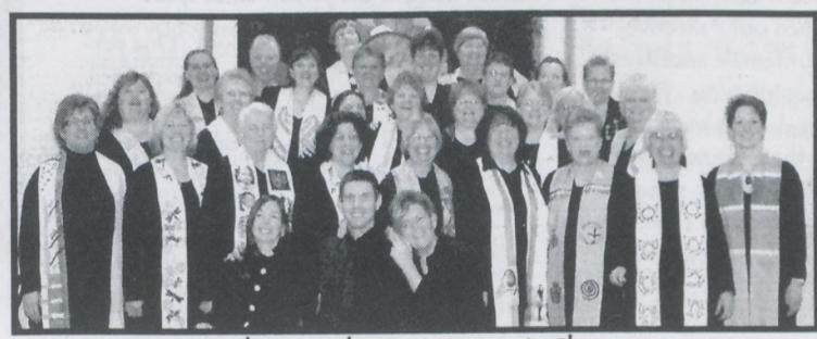
Central Pennsylvania Womyn's Chorus

Tickets: $10 $5 for seniors/students/children under 12