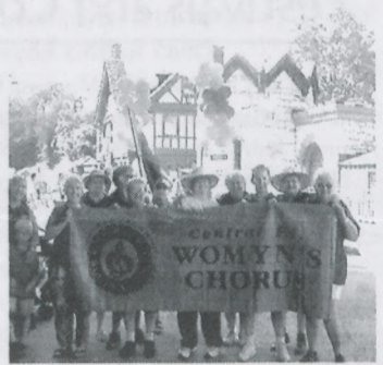
CPWC members march in the first Pride Parade in 2006!