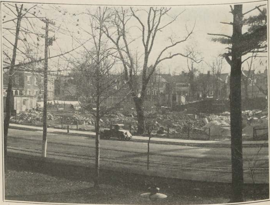
THE SITE OF THE ALUMNI GYMNASIUM

This photograph was taken from a window on the stairway of Bosler Hall on November 15, 1927. It shows the foundations for the building and the concrete mixer and steam shovel at work.