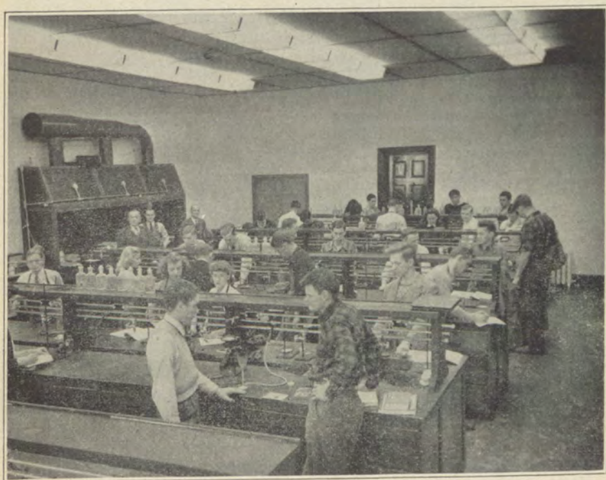
MUSEUM IS NEW CHEMICAL LABORATORY

WHILE work began last summer, it was not until the last semester that the major part of the rebuilding of the chemical laboratories in the Tome Scientific Building was completed. The complete rebuilding of the lecture room, offices, store rooms and laboratories has resulted in a modernization of the building which had had little done since its erection in 1884.