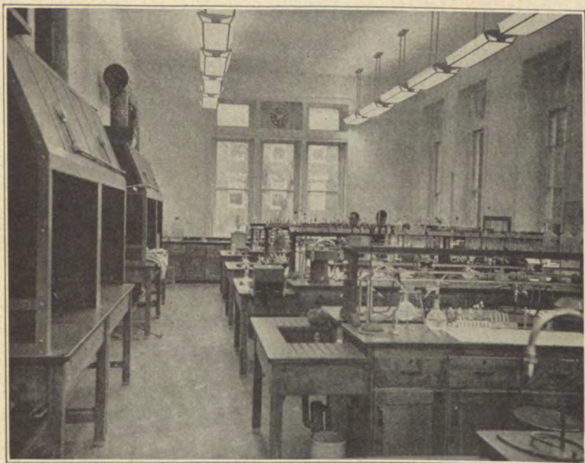
THE OLD LABORATORY REBUILT

have been rolled away to other shelves. The Denny tree may sprout again in the recesses of that room, and the winding stairway has been sold as old gold. One question remains, what to do with a stuffed dog?