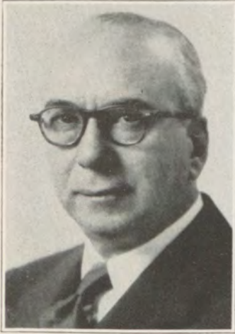
LEWIS L. STRAUSS