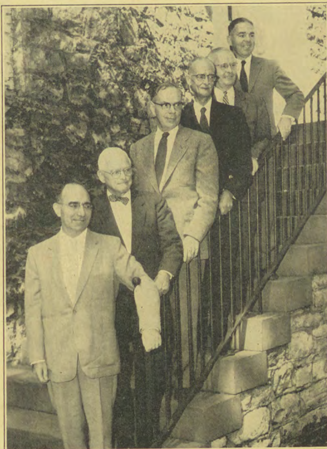
Six Move Up