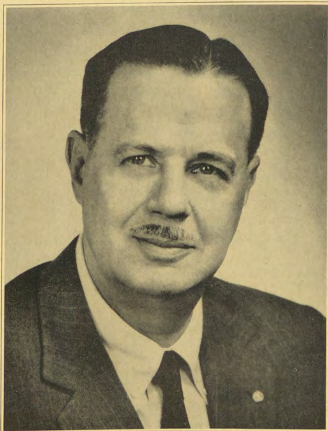
THE HONORABLE HUGH SCOTT U. S. SENATOR FROM PENNSYLVANIA COMMENCEMENT SPEAKER