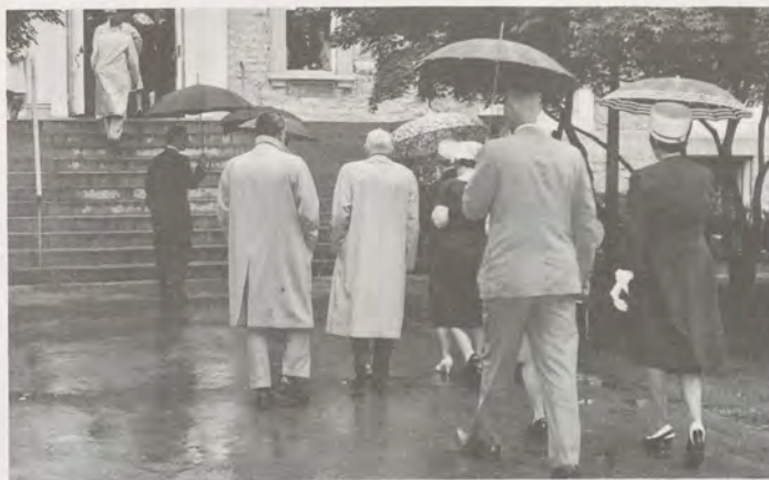
"Yes, it does rain in Carlisle occasionally."

If there is one thing I would hope you might carry with you from this college, it is an openness to the eternal possibility of the transcendent God breaking into your own existence and, in the meantime, that you might engage with true openness in an on-going dialogue with the biblical witness and with the spokesmen of the Judeo-Christian heritage across the centuries so that the relationship of justice and love might have greater clarity and urgency in our time. For we are responsible, whether we like it or not, to One who claims us—black and white, rich and poor—for His own.