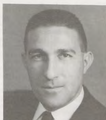
STEWART LEE UDALL Doctor of Laws

Sad in the knowledge that bigotry is virulent, ubiquitous, and Hydra-headed, you happily teach us that freedom and equality will prevail. Alma Mater today wishes you Shalom , peace, and hopes some day to add Mazel Tov , your mission is completed, happy day!