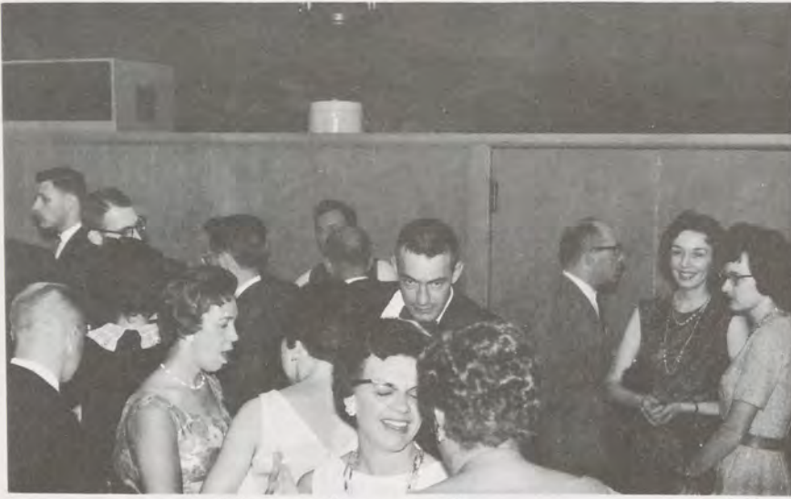
"It's so good to see you." "You certainly don't look 10 years older" —says the Class of '53 at their 10th reunion.