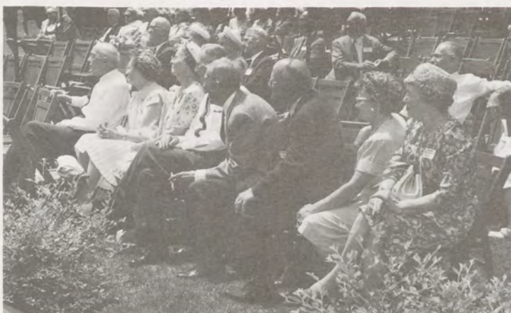
The Class of 1908 deserves a spot up front.