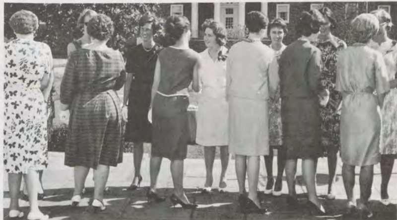
—Congratulations and best of luck.

ALUMNI returning for the weekend began to make their appearance at the registration tent during Friday. Many of the parents of members of the graduating class also began to arrive early on Friday in order to be on hand for the annual Dean of Women's Tea honoring the female members of the senior class.