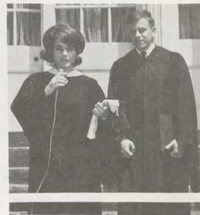
"We hereby bequeath to the junior class . . ."