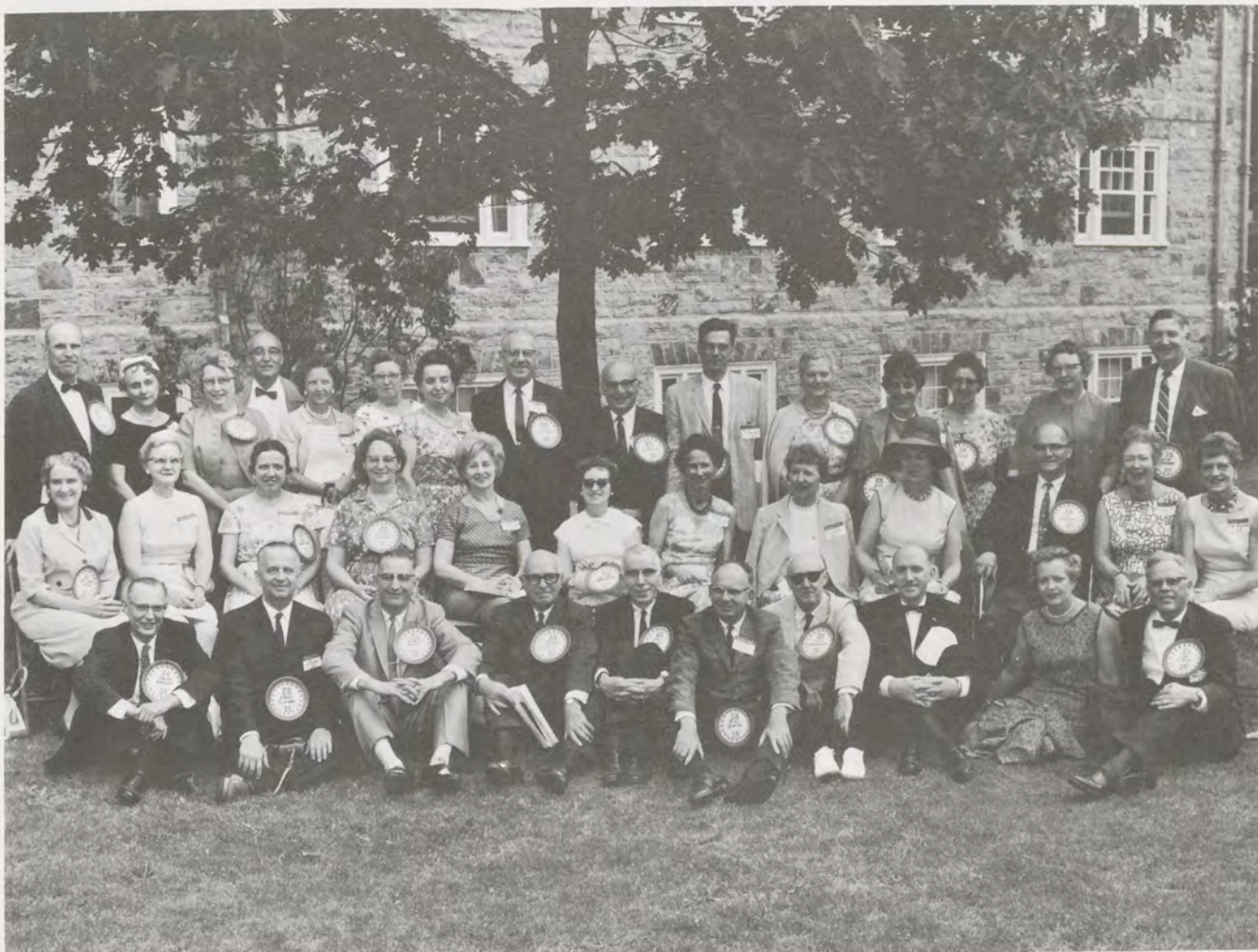
The Class of 1928 finds a shady spot under the trees for their reunion.