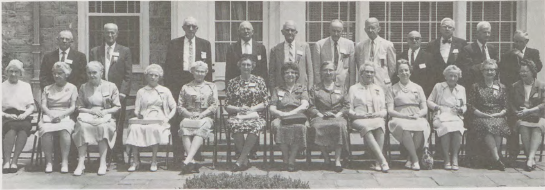
The Class of 1913 proudly adorns the platform at the Alumni Luncheon.