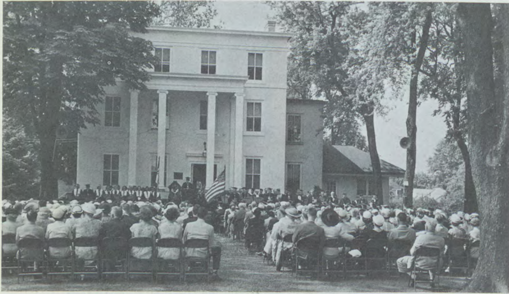
Baccalaureate takes place in front of Baird Hall (left) in 1954. The building was the Mooreland Park mansion until purchased 1932, named for Spencer Fullerton Baird, class of 1840, and used for biology. Baird Hall was demolished in 1966 to make room for Witwer Hall.