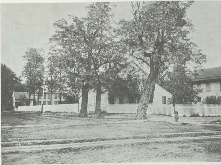
The Denny family property (left) was purchased by the College for $100—on condition that the building placed there be a Denny Memorial. The second Denny Hall standing on the northeast corner of High and West streets was built in 1905. Not long after its construction in 1885, Tome Scientific Building (below) was photographed. This card, ca 1891, shows Louther street still a dirt road.