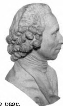
By Wedgwood; see following page.