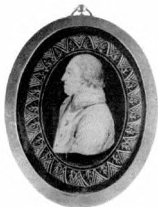
The "Etruscan Profile"