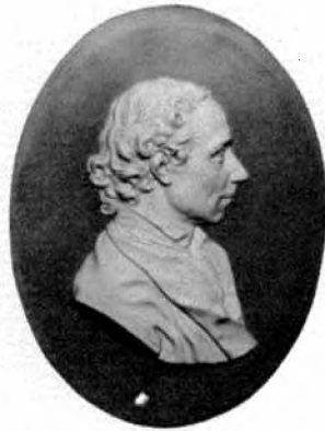
Wedgwood, later version