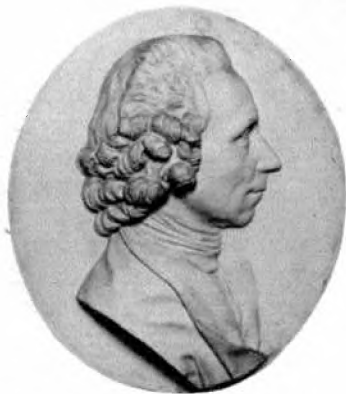
Ceracci model of Wedgwood, c. 1777