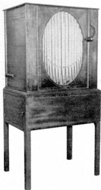
The Barrel Organ