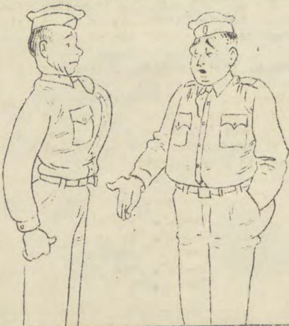
"Who gave this gentleman 'At ease!'"

Long may it wave! It's up to us to keep it waving!