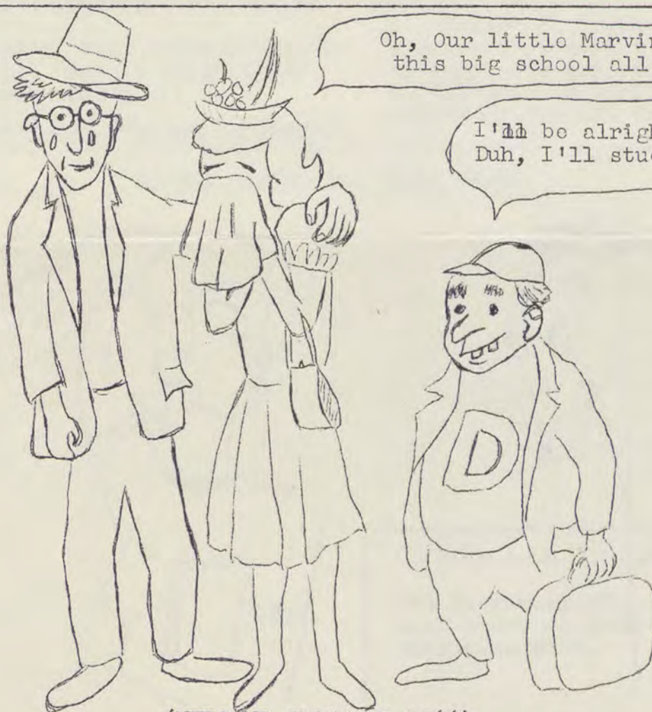
(WELCOME CLASS OF 1966)

The President's and Faculty reception will be held tonight in Alumni gymnasium at 8:00. It is a general get-together of the new students, old students and the members of the faculty. Everyone is invited.