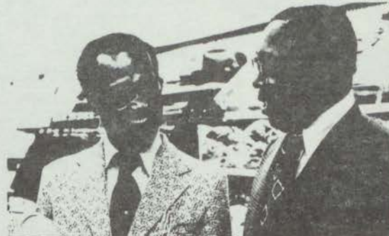
District Manager (right) gives advice on new merchandise to store manager