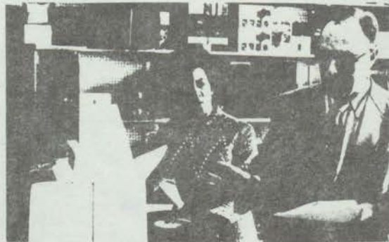
Two buyers review merchandise for upcoming sales promotion report