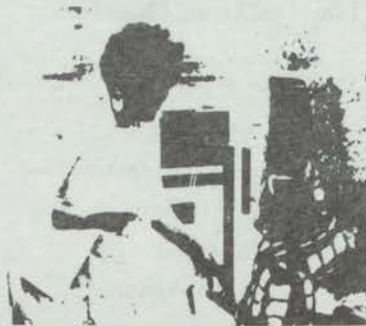
Store manager assists young customer