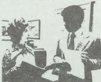
Urban Affairs Attorney and Assistant Corporate Vice President discuss security measures