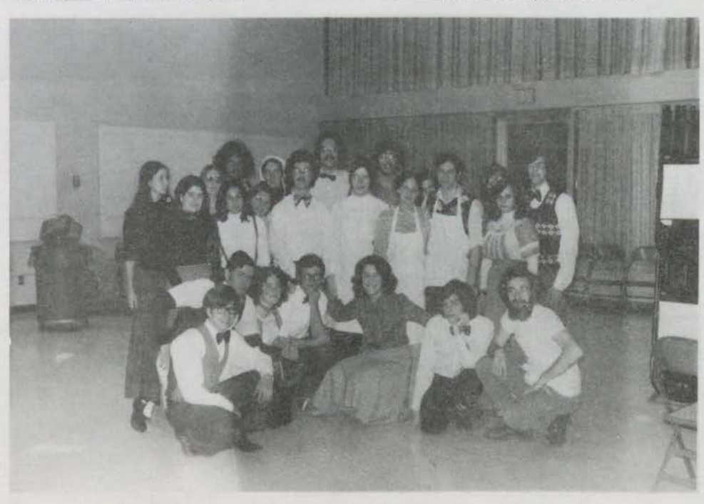
All those who contributed their efforts to make Uncle Herbie's a success.

Hillel's co-ed volleyball team played inspired ball throughout the season but they could only muster one victory in the short season. However, the atmosphere was relaxed and everyone had fun.