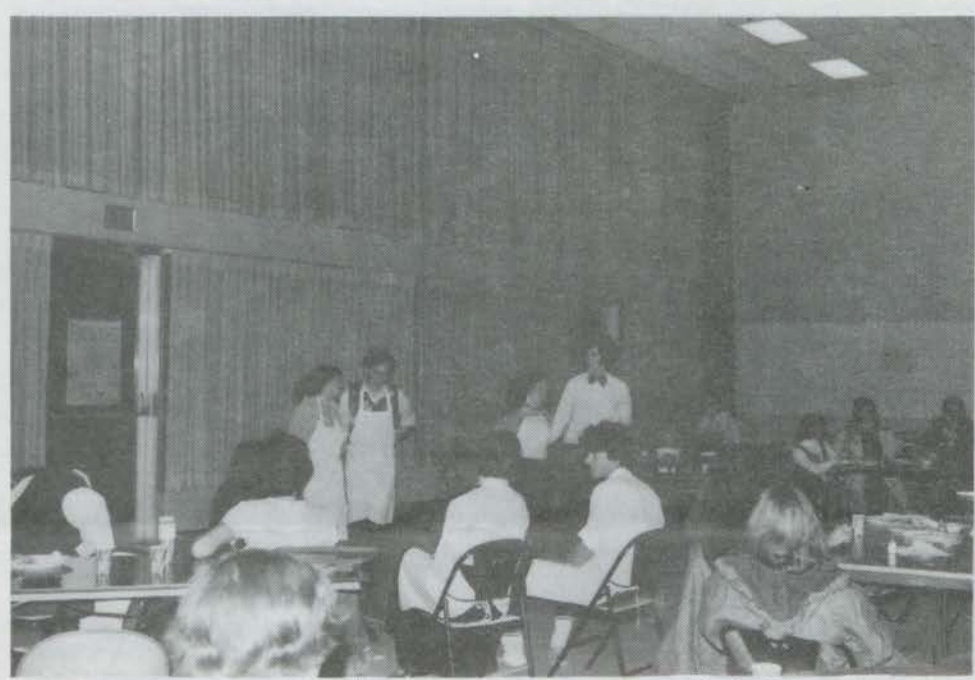
Famed dancing waiters and waitresses at Uncle Herbie's Deli, Good food plus entertainment!