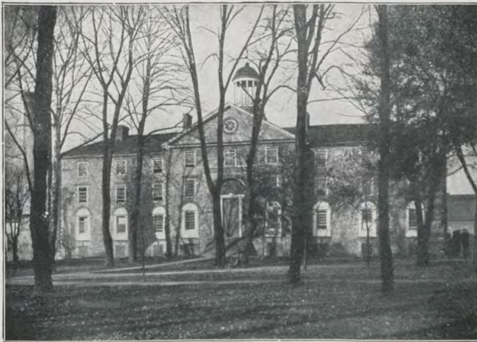
DICKINSON FOR AYE!