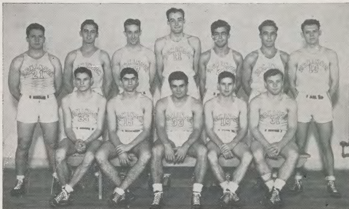
DICKINSON BASKETBALL SQUAD