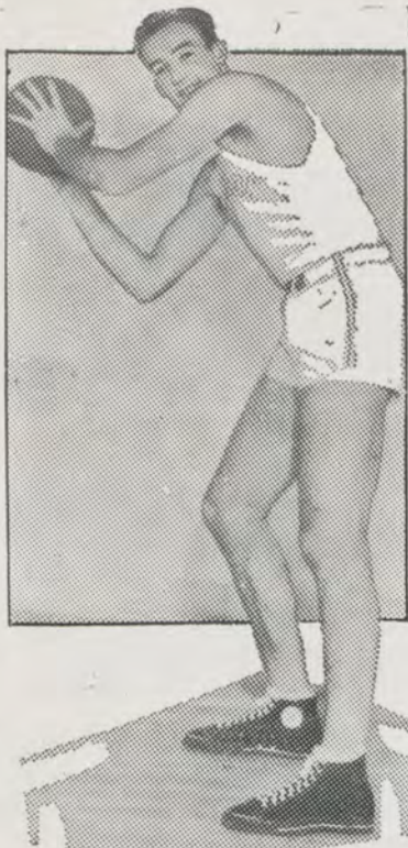
WILLIAM "BIG BILL" KINTZING DICKINSON CENTER