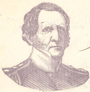
Lieutenant General Winfield Scott