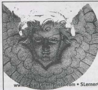
Susan Lerner Photography NYC • York, PA

Camping registration deadline is Friday, September 5, 2003. To register please go to: www.susq.org , click on trips in left column and scroll down to Women's Weekend in September, and click on Register Now!