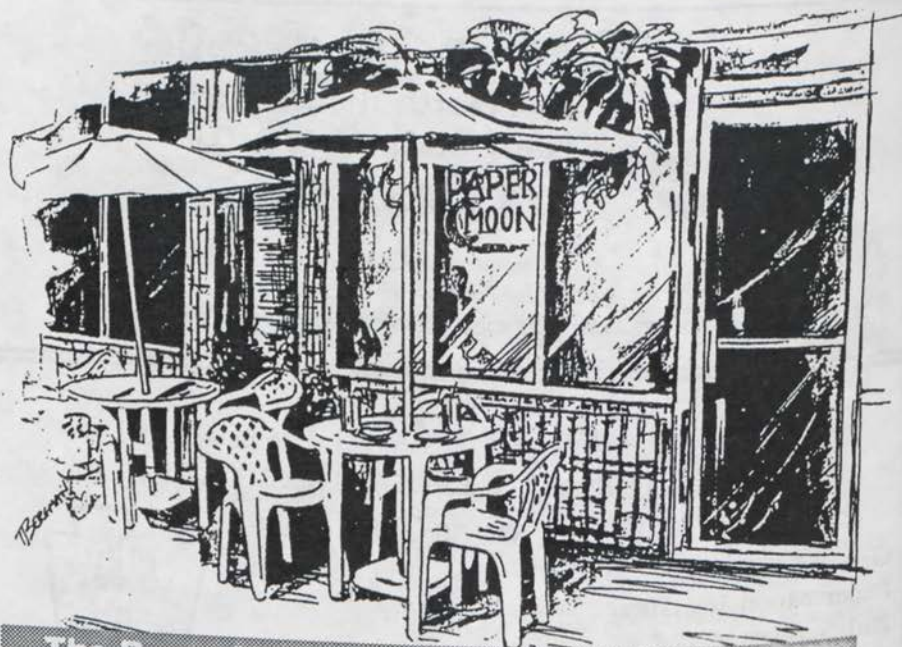
The Paper Moon - 268 North St. - Harrisburg