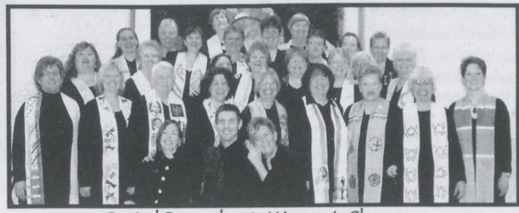
Central Pennsylvania Womyn's Chorus

Bringing together a diverse group of women, united by the joy of singing, to celebrate and empower women, and to affirm a positive image of lesbians and feminists.