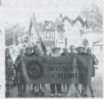
CPWC members march in the first Pride Parade in 2006!